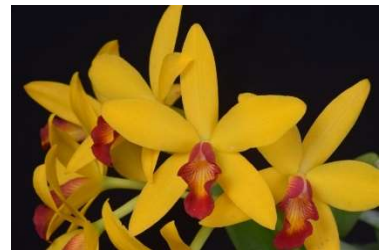
CATTLIANTHE BLAZING SUN 'BINGO'. AM |AOS |October 22, 2021