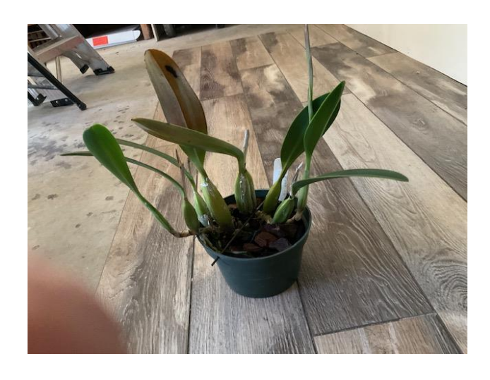
NOT this plant Plant photo IS this plant