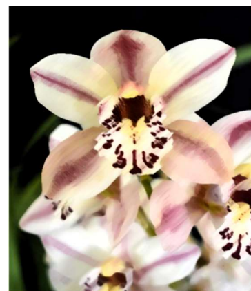
Cymbidium Conni Ferrusi (2021 Hatfield introduction)

This restaurant is a 5-minute drive from the meeting venue. If you wish to attend, please RSVP to bondddiane9@gmail.com by 5 PM Wednesday, July 12 so that I can make reservations.