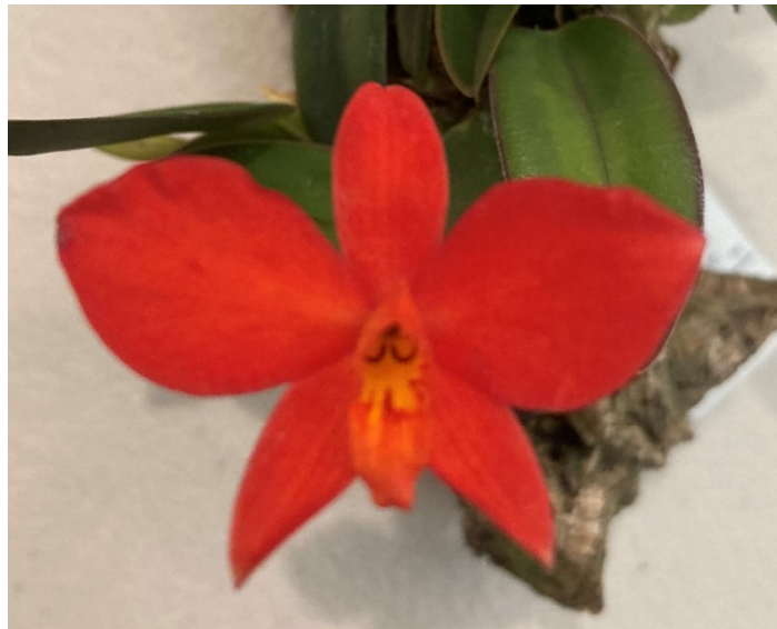
Dendrobium Victoria Blush Novice: 1 st Place Grown by Sonya Provaznik