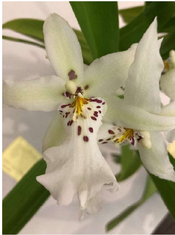
Laeliocatathron 'Silver Snowflake'