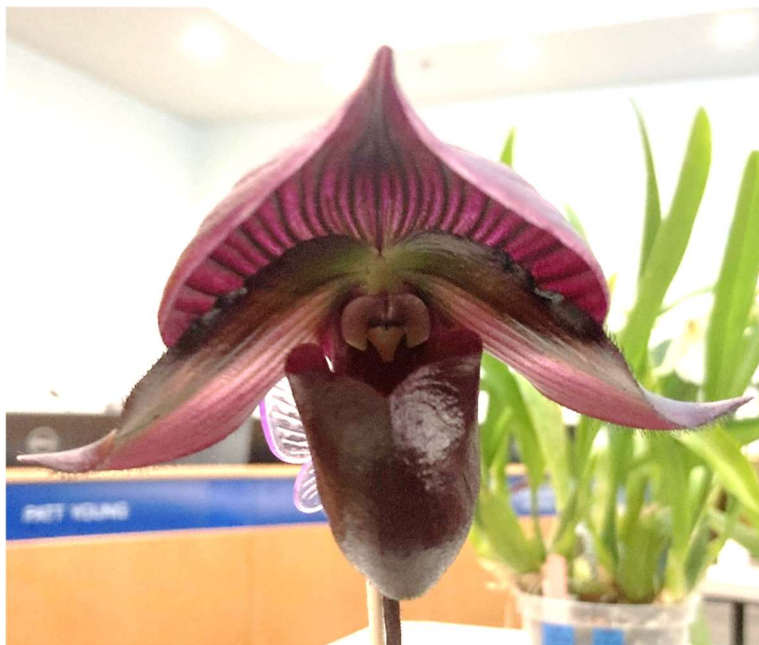
Paph Hung Shen Bay '#1' x Ung Shen Bay 'Chx' Intermediate: 2 nd Place Grown by Kaitlyn Strom