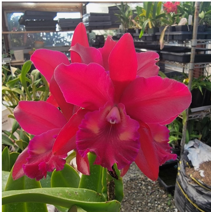
3 rd : Potinara Shinfong Beauty x Cattleya Chocolate Drop, grown by Rachel Brinkerhoff