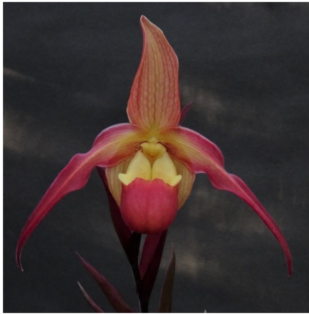
3 rd : Phragmipedium Nicholle Tower grown by Diane Bond