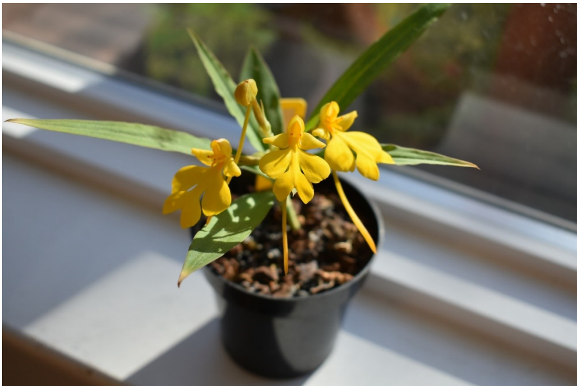
3 rd (tie): Habenaria xanthocheila , grown by Miki Ichiyanagi