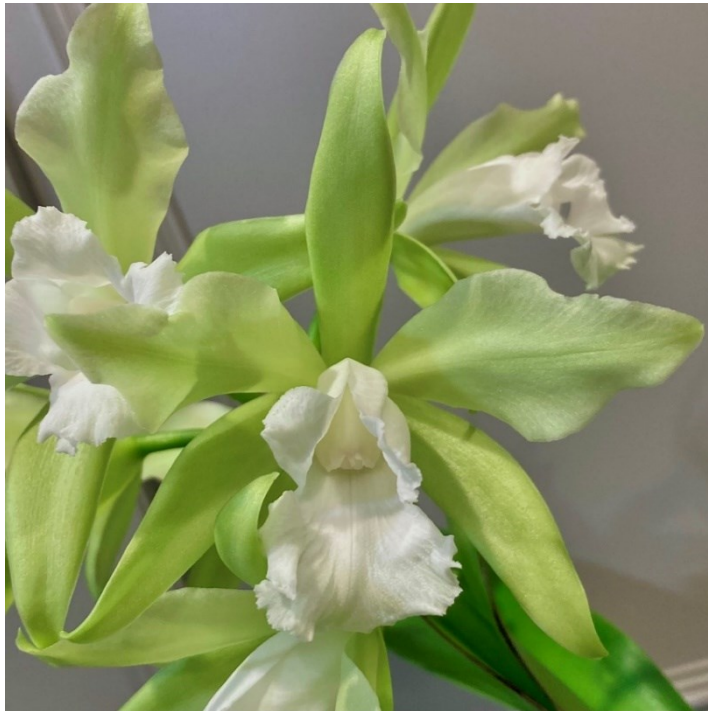
1 st : Cattleya Elegans f alba , grown by George Su