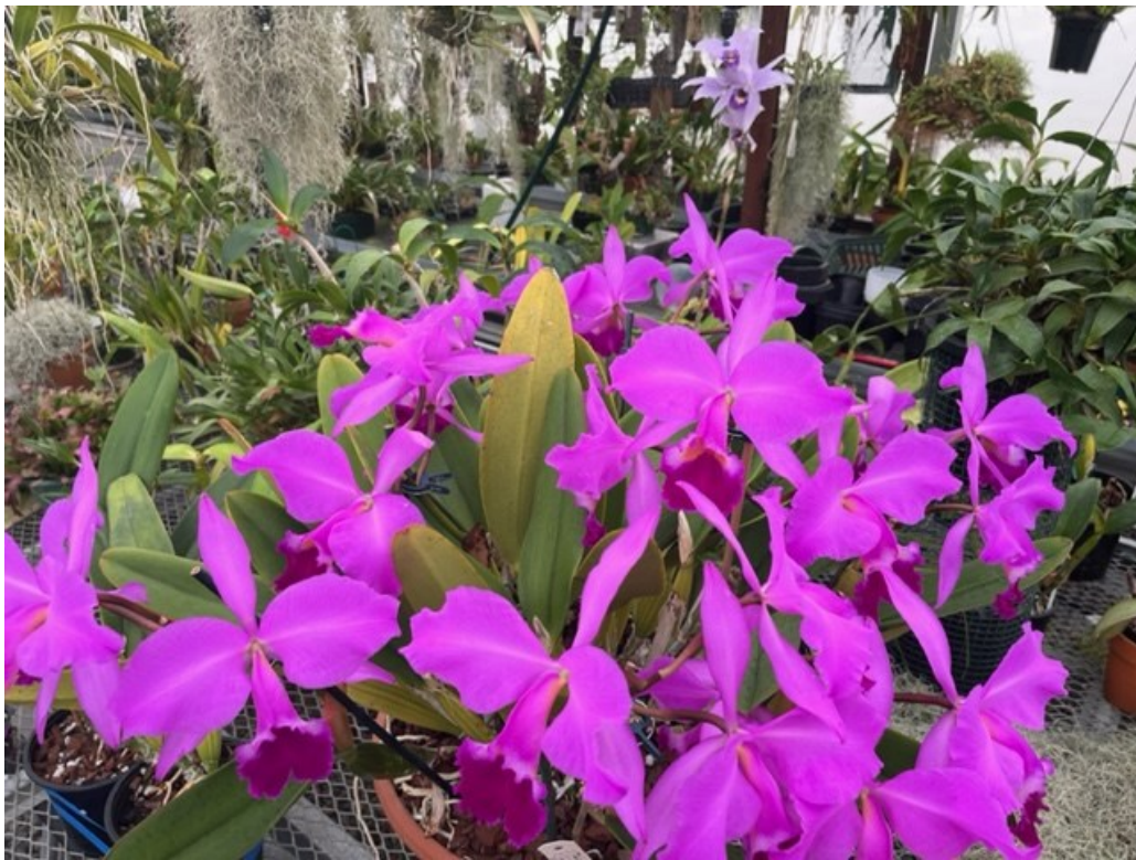
1 st : Cattleya labiate grown by Tom Pickford