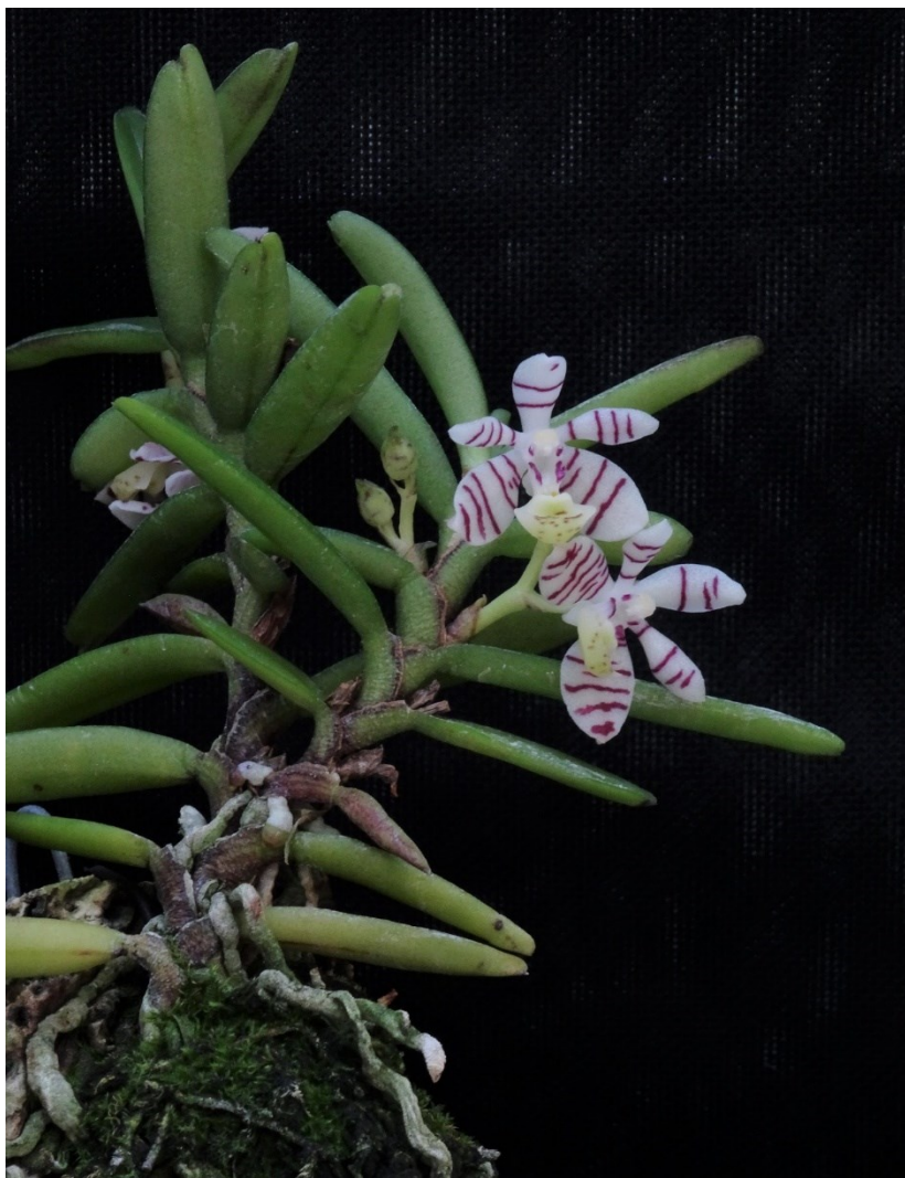
1 st : Trichoglottis pusilla , grown by Diane Bond