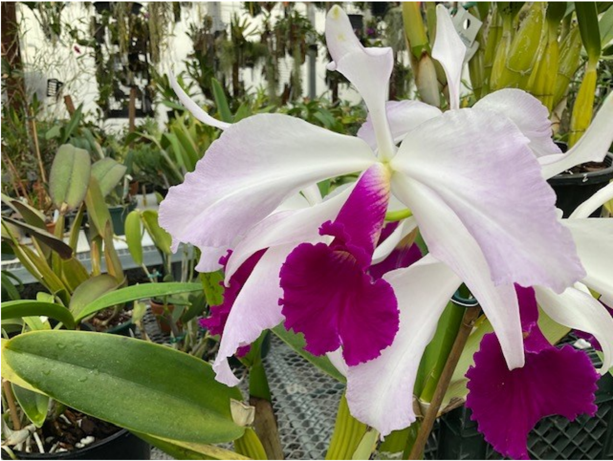
3 rd (tie) Cattleya Eximia , grown by Tom Pickford