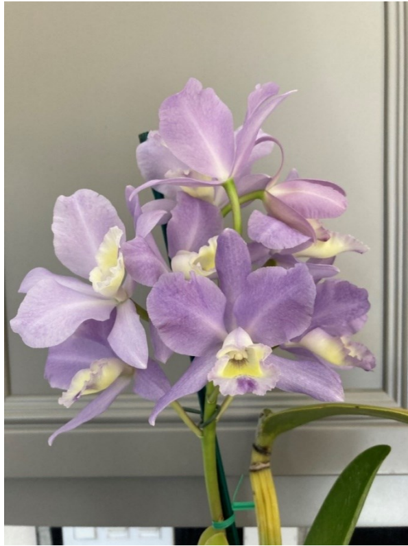
2 nd : Cattlianthe Minerva, grown by George Su