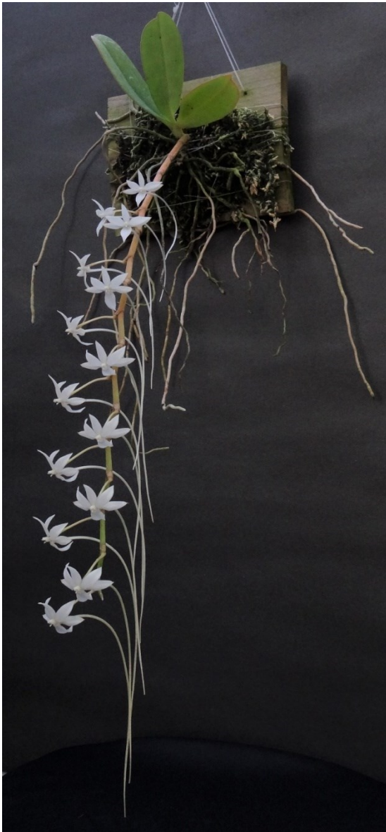
1 st : Aerangis Elro, grown by Diane Bond