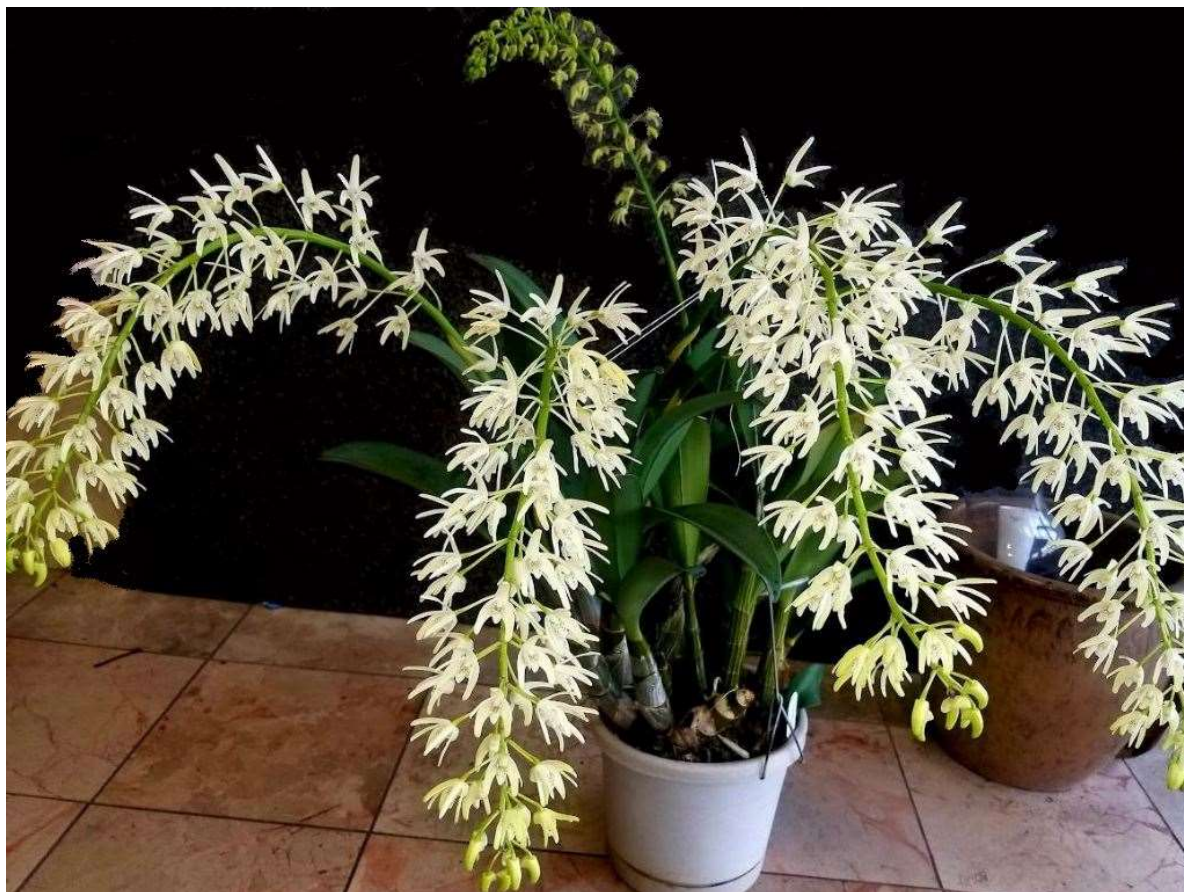
Dendrobium speciosum 'Moon Shadow' Master Division Grown by Sung Lee