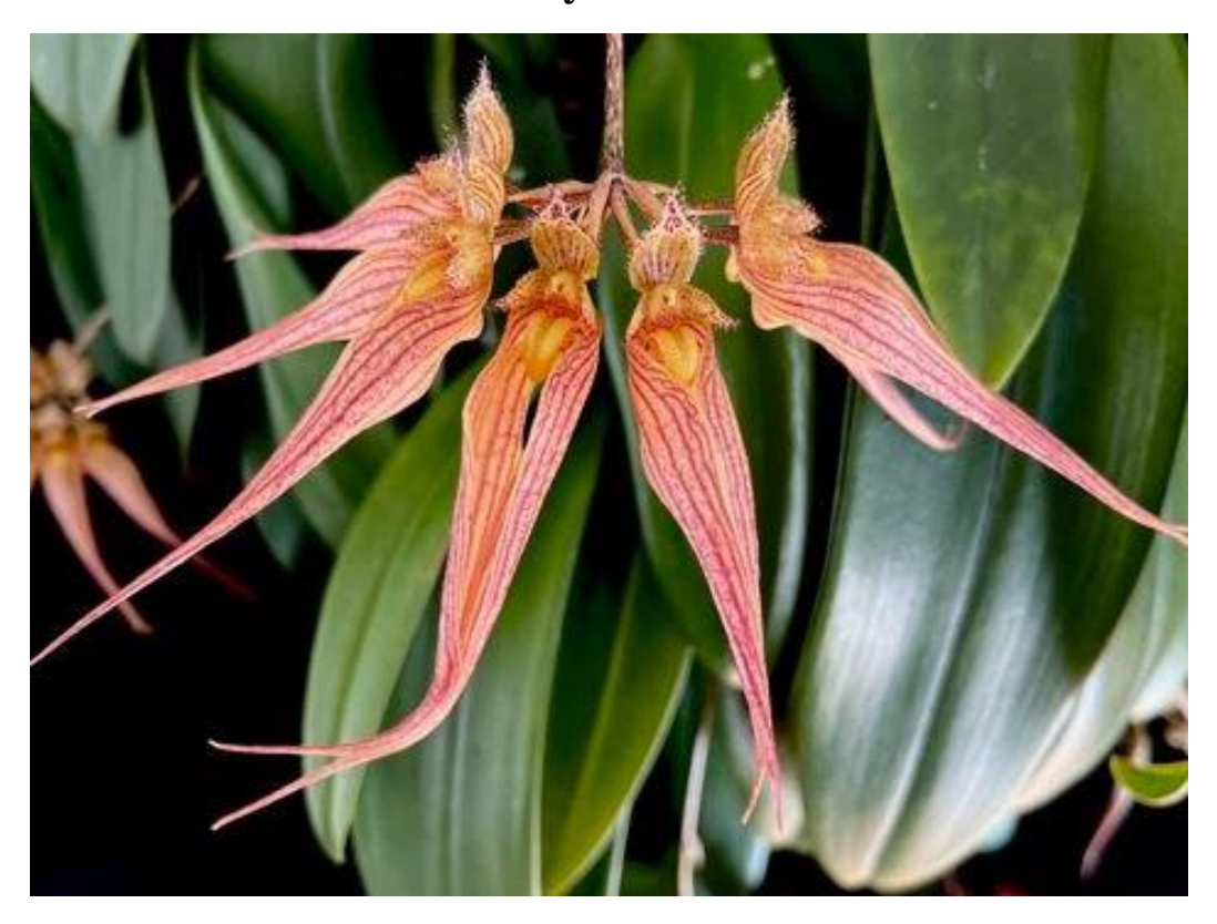
Bulbophyllum Eed Advanced: 2<sup>nd</sup> Place Grown by Eileen Jackson