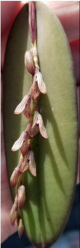
Pleurotyallis pubescens Novice: 1 st Place Grown by Carol Basset