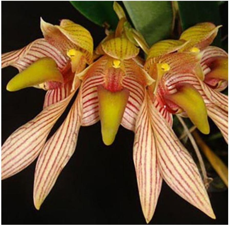
Bulbophyllum discolor Novice: HM 1 st Place Grown by Daniel Neighbors