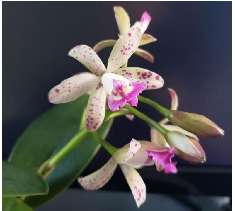
LC Tropical Pointer 'Cheetah' Novice: 2 nd Place Grown by Rachel Brinkerhoff