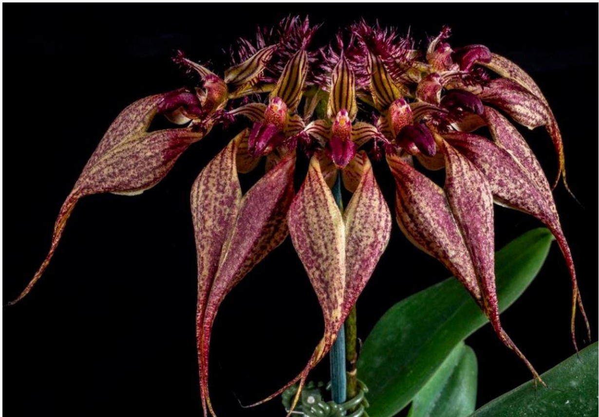
Bulbophyllum rothschildianum Novice: HM 2 nd Place Grown by Daniel Neighbors