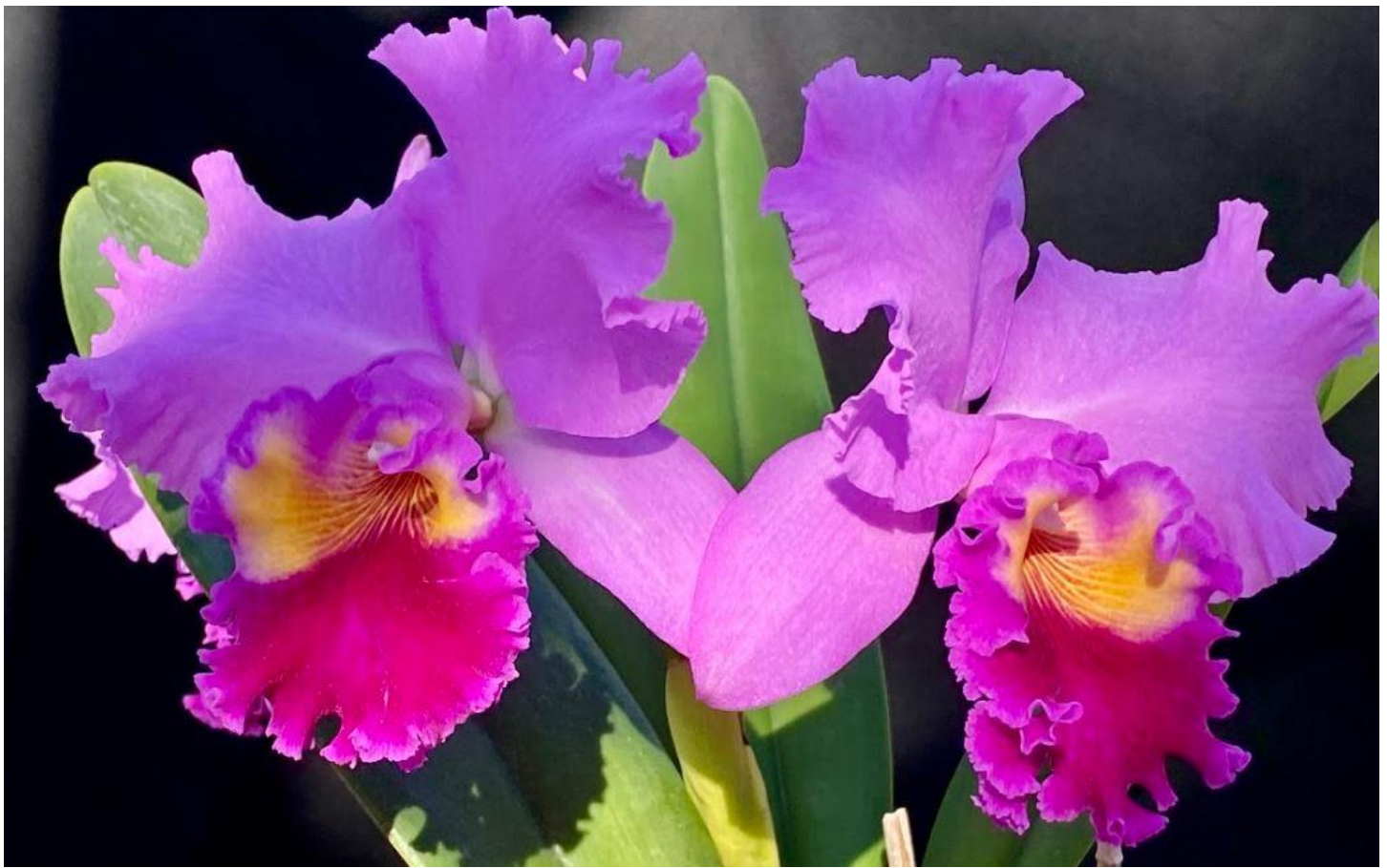
Laeliocattleya Drumbeat Intermediate: 3 rd Place Grown by Linda Castleton