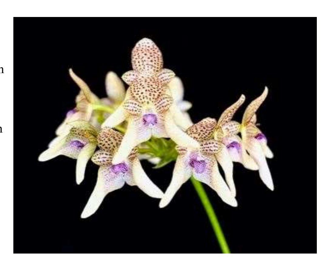
Bulbophyllum guttulatum Advanced: 3<sup>rd</sup> Place Grown by Eileen Jackson