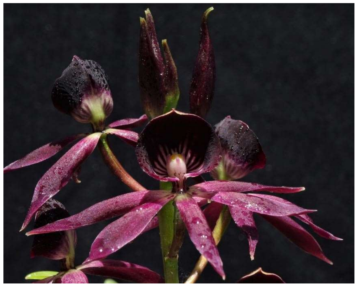
Guarechea Black Comet 'Indigo Blue' Advanced: 2<sup>nd</sup> Place Grown by Diane Bond