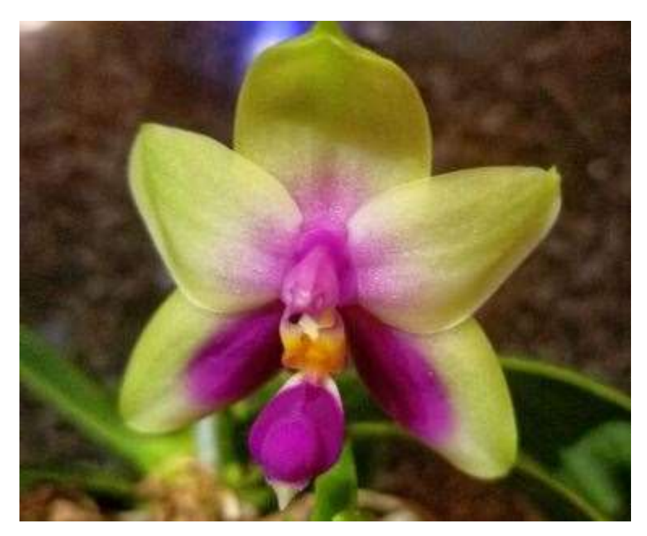
Phalaenopsis belina var. coerulea x sib Grown by Henry Shaw Intermediate: 3<sup>rd</sup> Place