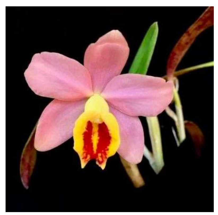
Sophorocattleya Crystelle Grown by Eileen Jackson Advanced: Tied for 3<sup>rd</sup> Place