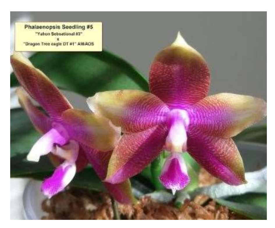
Phal seedling #5 Yahon Sebsational #3 x Dragon Tree Eagle DT #1 AM/AOS Grown by Peter Ansdell Novice: 3<sup>rd</sup> Place