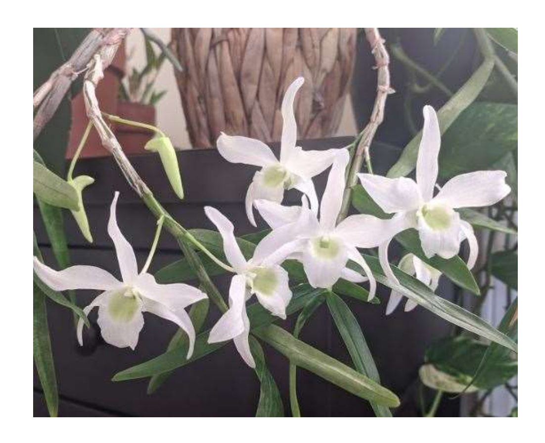
Dendrobium Ise 'Pearl' Grown by Kaitlyn Strom Novice: 2<sup>nd</sup> Place