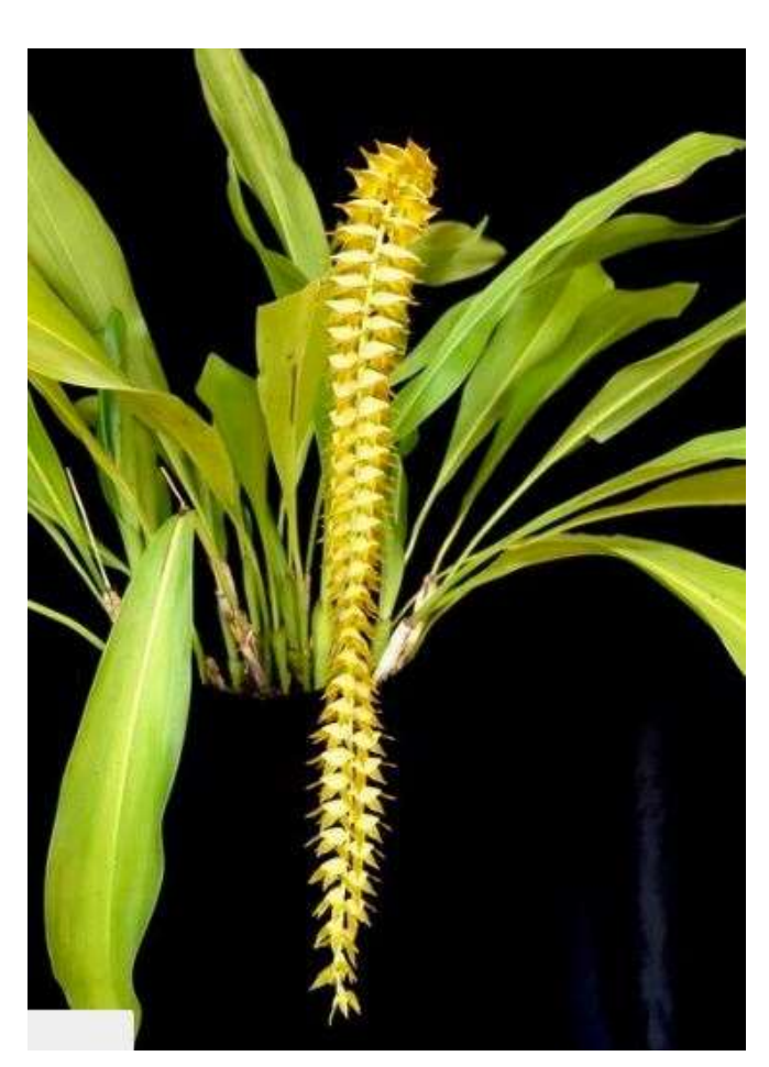
Dendrochilum latifolium Grown by Eileen Jackson Advanced: Honorable Mention 3<sup>rd</sup> Place