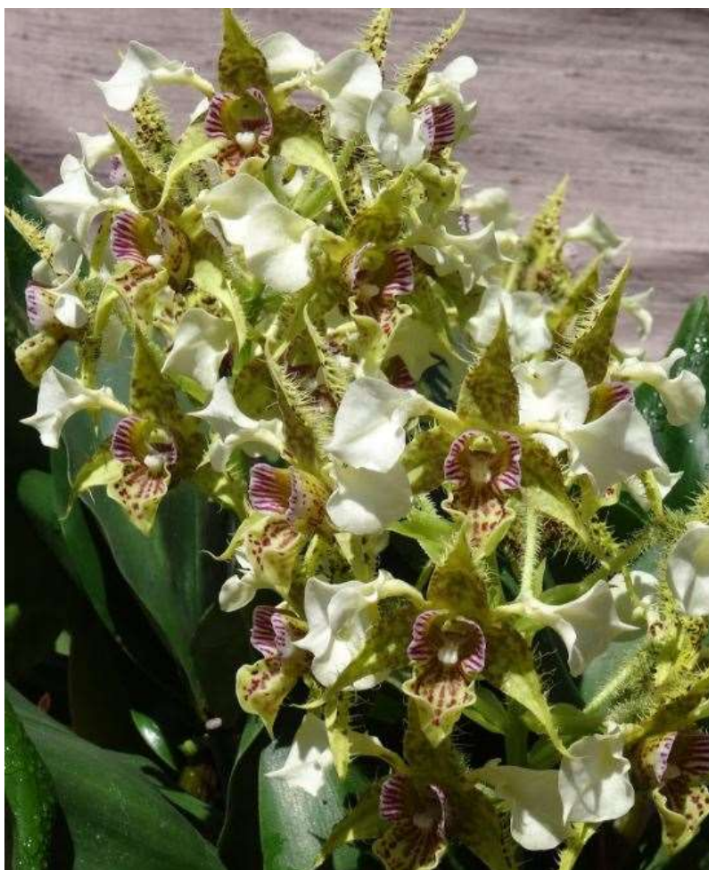
Dendrobium eximium x polysema Advanced: 2 nd Place Grown by Diane Bond