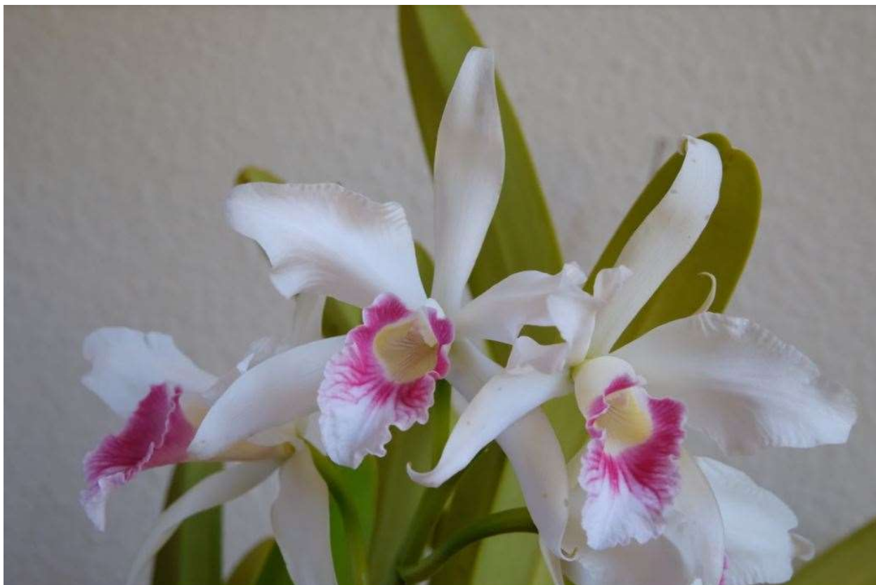
Laelia purpurata carnea Intermediate: 2 nd Place Grown by Barbara Ungersma