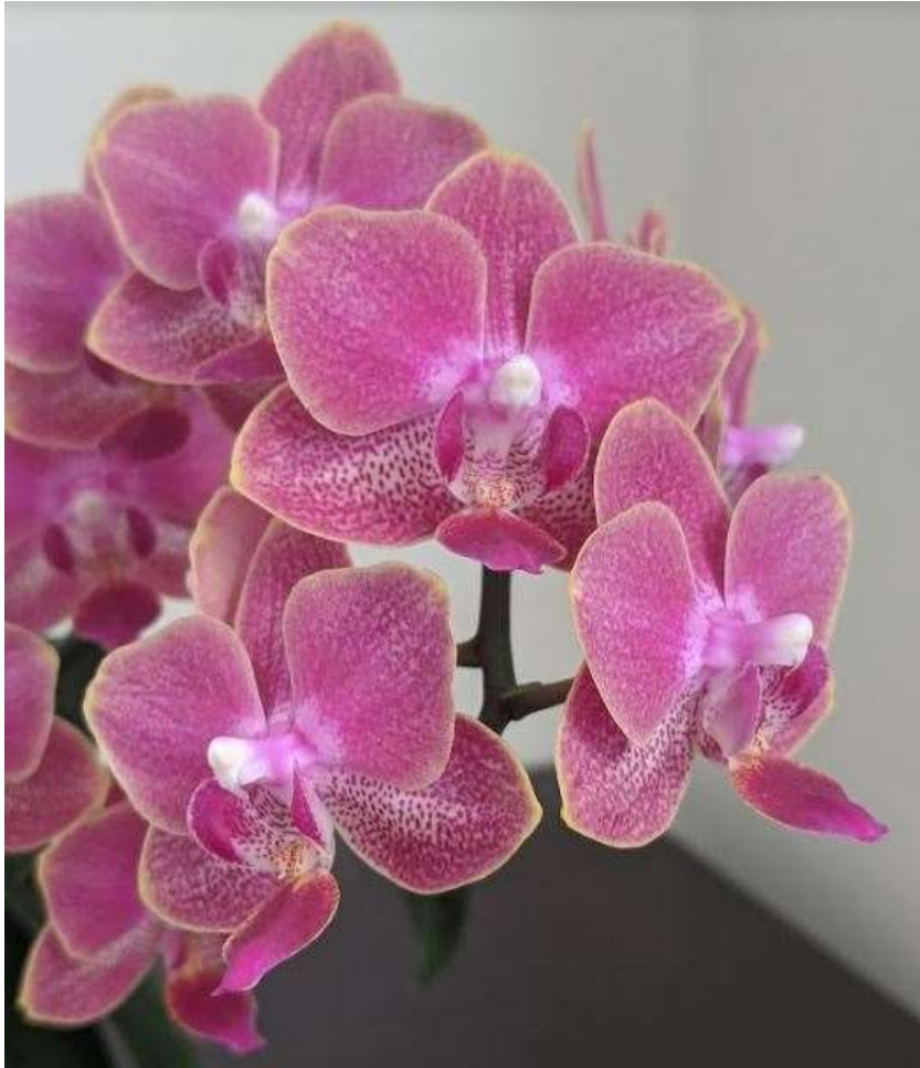
Phalaenopsis Younghome Sunkist Y9742 Novice: 3 rd Place Grown by Kaitland Strom