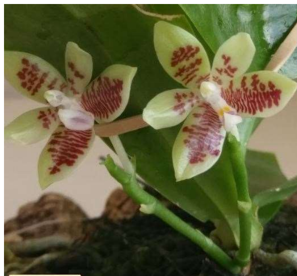
Phalaenopsis inscriptiosinesis Novice: 2 nd Place Grown by Peter Ansdell