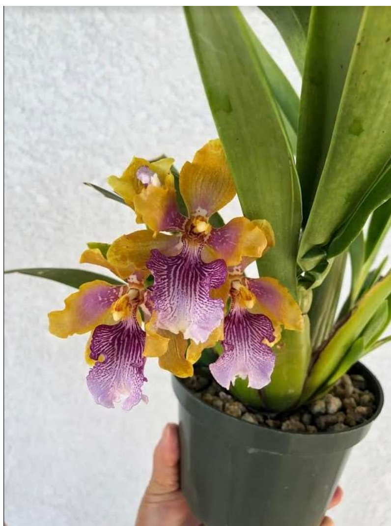
Odontoglossum wyattianum Grown by Yunor Peralta Advanced: 1 st Place