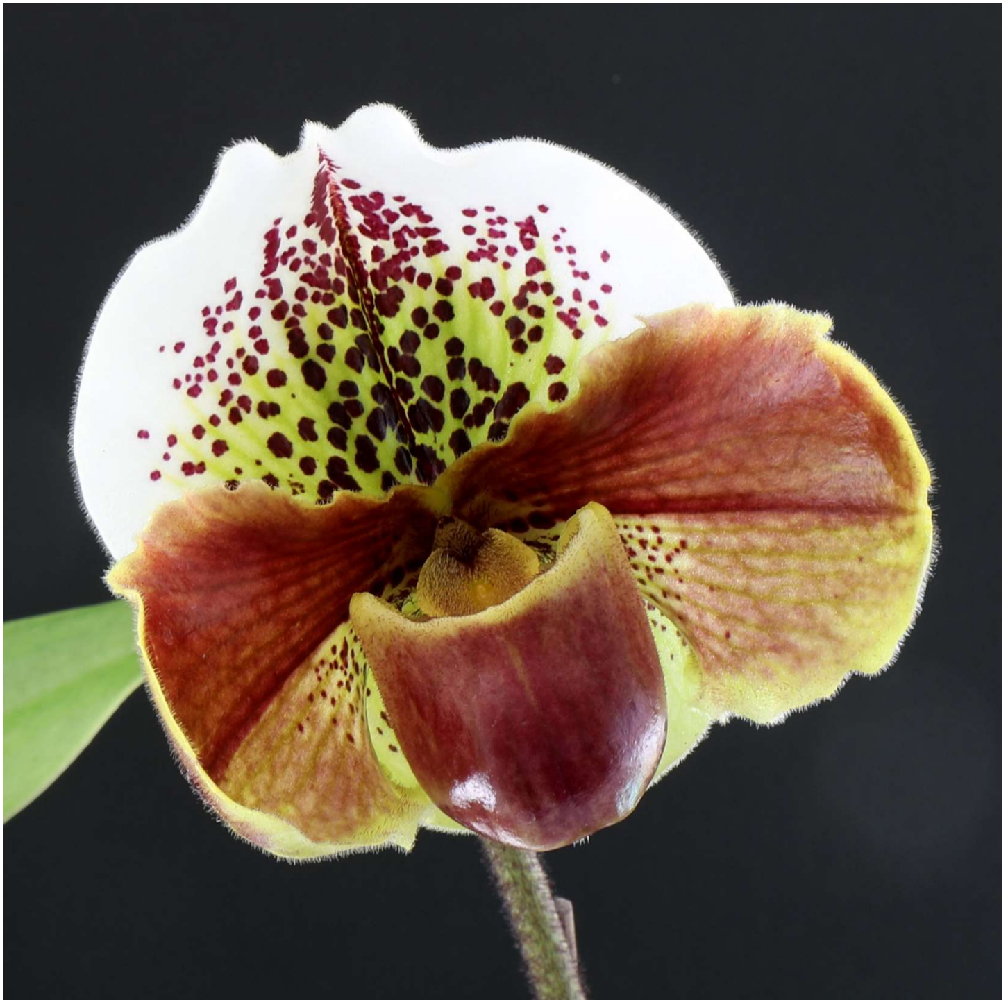
Paph. New Generation x Lancer 'Alien form'