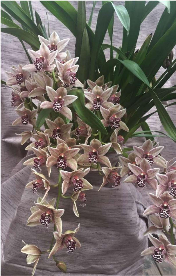
Cymbidium Son of Freak x Cymbidium devonianum