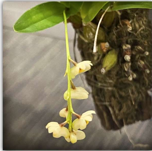
Dendrobium schneiderae Intermediate: 3rd Place Grown by Chen-Chao Hsu