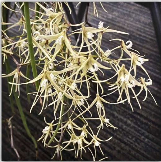
Dendrobium teretifolium Intermediate: 2nd Place Grown by Chen-Chao Hsu