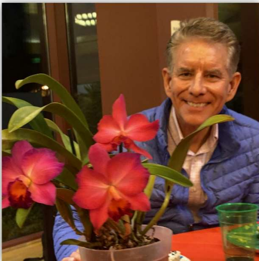
A happy raffle winner