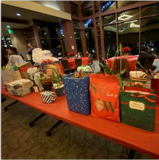
Our gift table