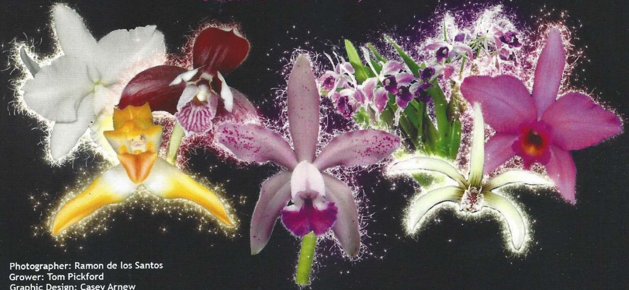
Grower: Tom Pickford Graphic Design: Casey Arnew