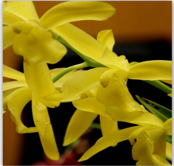
Cymbidium Golden Elf Intermediate: 3rd Place Grown by Jeanette Bean