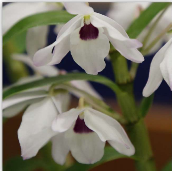
Den Nagasaki Cherry Blossom' Novice: 2nd Place Grown by Diane Bond