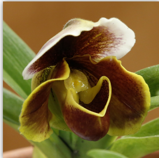
Paph - Noname Novice: 2nd Place Grown by Celeste Graham