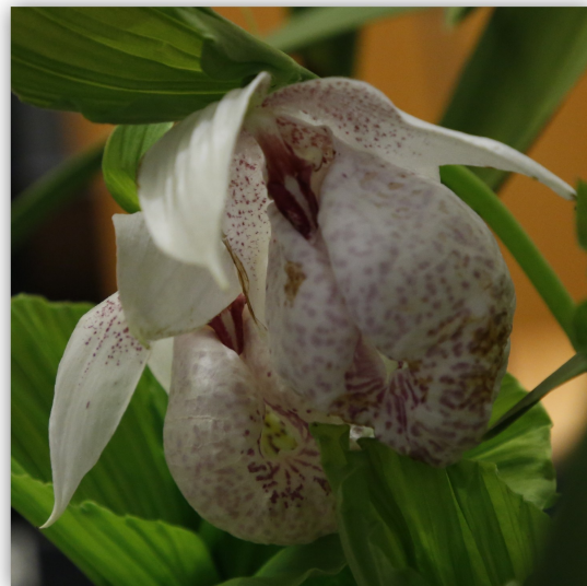
Cypripedium formasonium Intermediate: 1st Place Grown by Chen-Ho Hsu