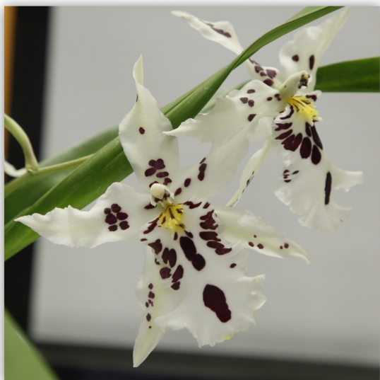
Beallara "Snowblind Sweet Spots" Grower: Marcia Hart Intermediate: 2nd Place