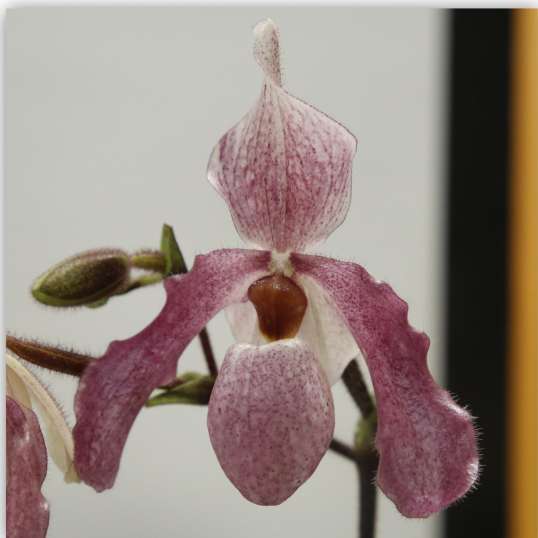
Paphiopedilum Grassau Grower: Eileen Jackson Advanced: 2nd Place