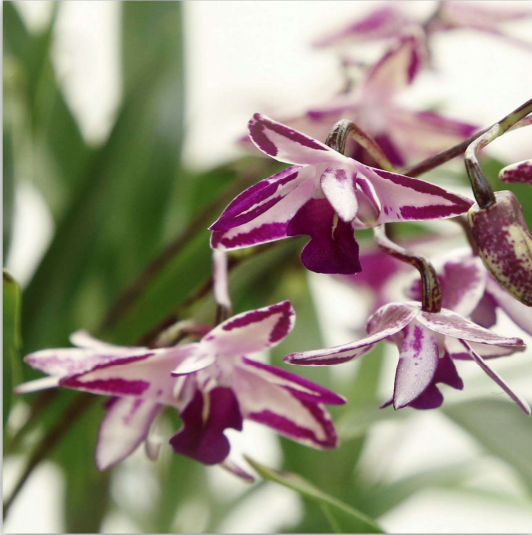
Dendrobium King Zip 'Super Star' Grower: Diane Bond Novice: 1st Place