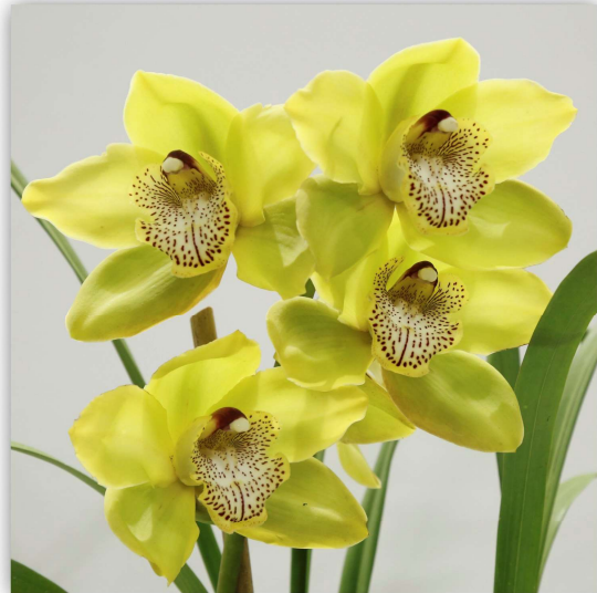
Cymbidium Hybrid Grower: Chen-Hao Hsy Intermediate: 1st Place