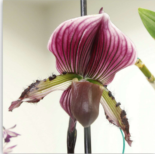
Paphiapedilum (no name) Grower: Don Taylor Novice: 2nd Place