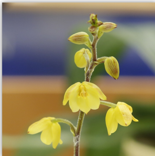
Polystachya Pubescens Grower: Chen-Hao Hsy Intermediate: 3rd Place