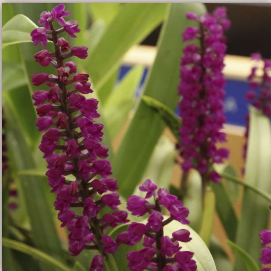
Arpophyllum alpinum Advanced: 1st Place Grown by Sung Lee