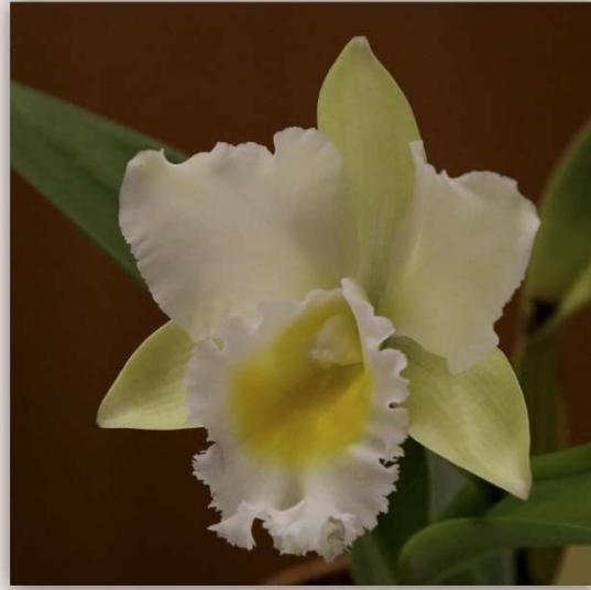
Cattleya 'Apple Blossom' BLC Interm: 3rd Place Grown by Linda Castleton