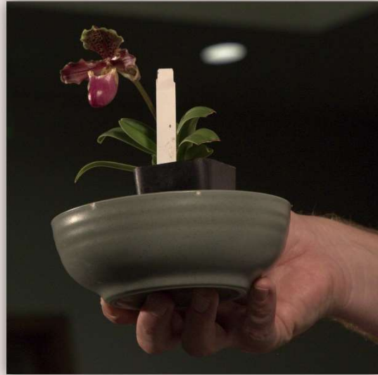
An example of how small some of our orchids can be