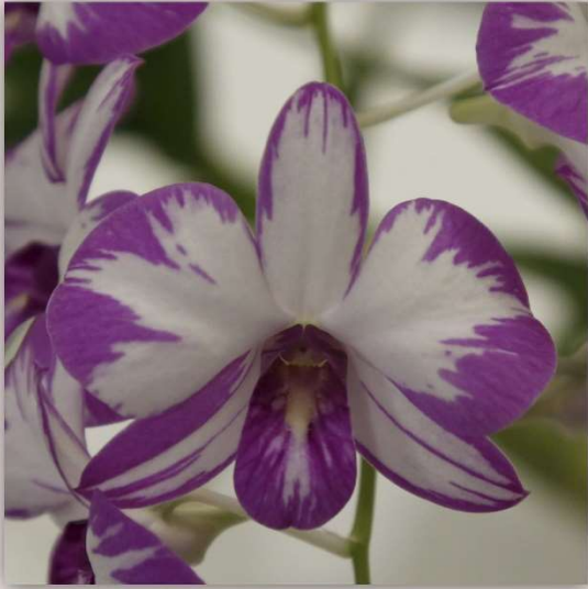
Den Enobi Purple 'Splash' Interm: 2nd Place Grown by Barbara Ungersma