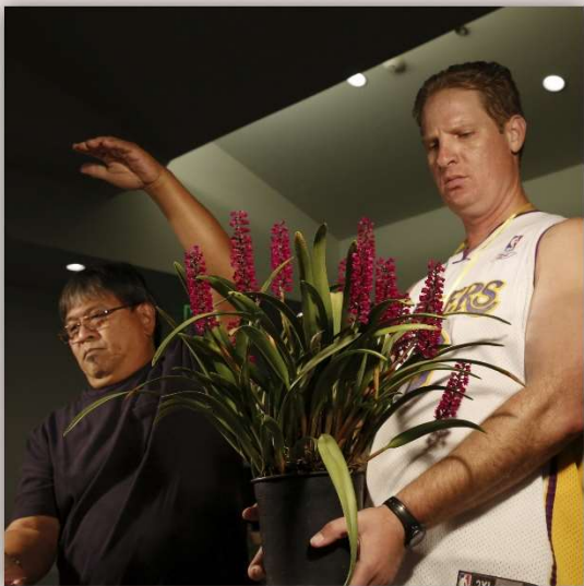
An example of how large some of our orchids can be