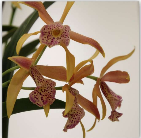
Advanced: 3rd Place BL Sunset Glory Grown by Phyllis Arthur