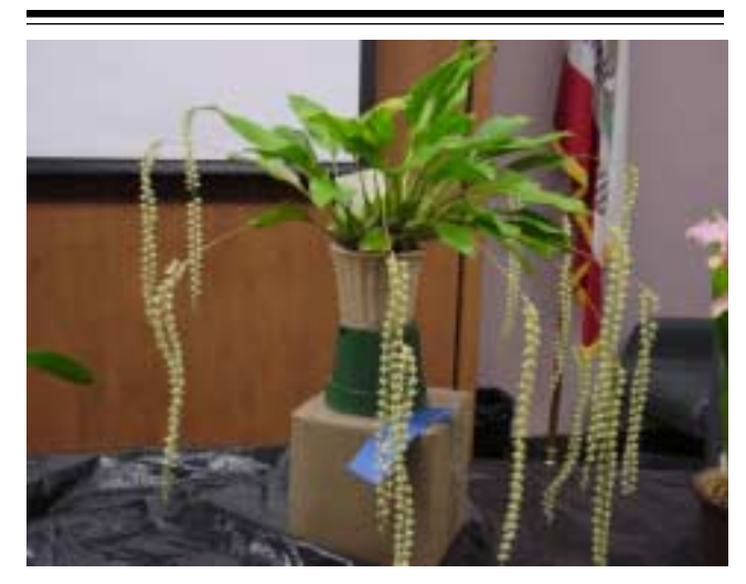
Dendrochilum latifolium owned by Dick Emory. First place in DVOS competition

DISCLAIMER:. DVOS presents these views as a service to share information. Growing conditions will vary, so you may not get the same results. You should exercise appropriate discretion and consider your conditions and level of expertise before deciding whether or not to try these tips. Also evaluate and test the recommendations on sample plants and judge the results for yourself before trying the tips on a larger scale.