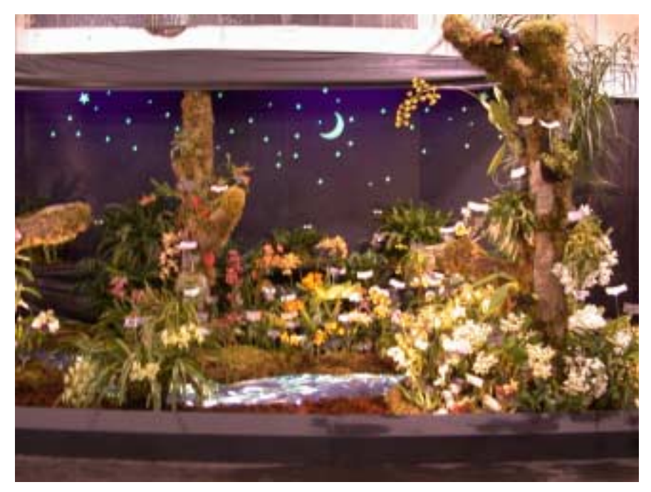
The DVOS display at the SF Orchid show