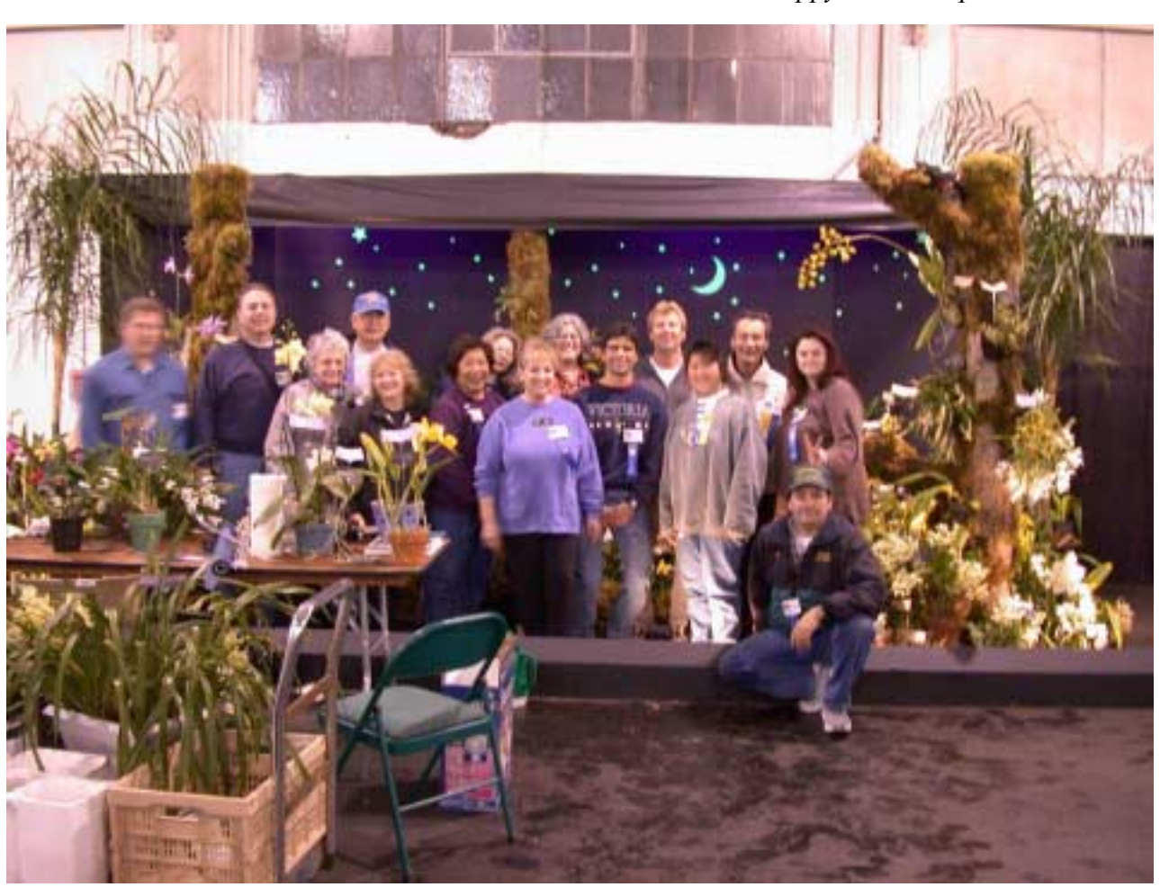
And the happy crew that produced it