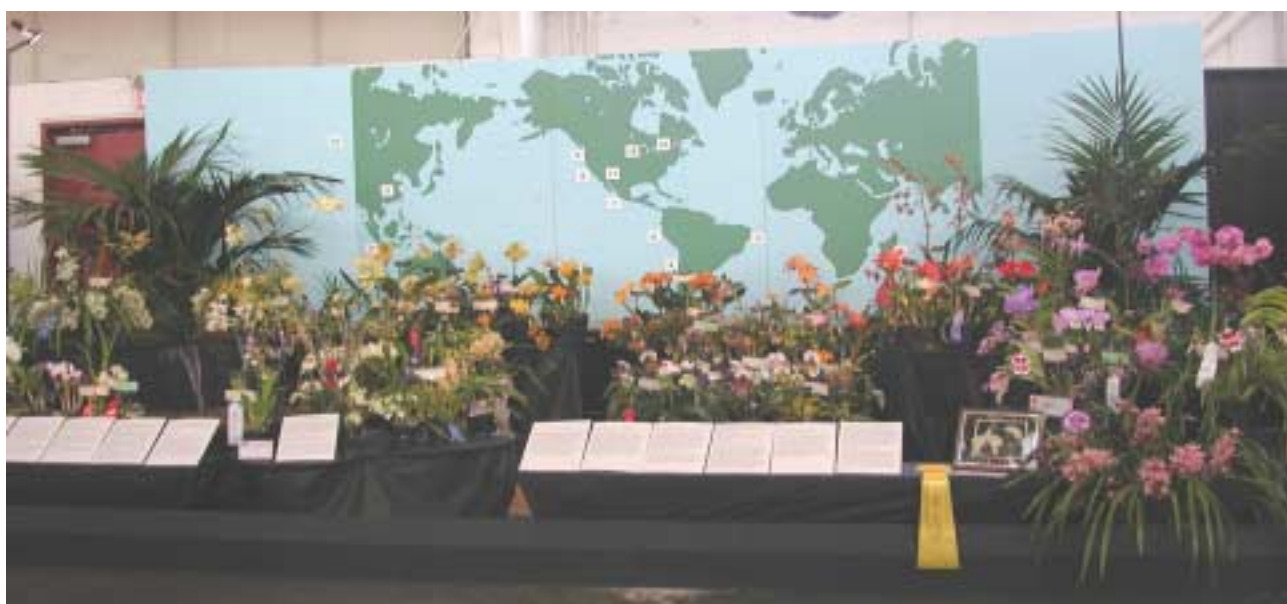
The DVOS Display

Bernice Lindner - 'Best Pleurothallid shown by an Intermediate Exhibitor - Restrepia sanguin