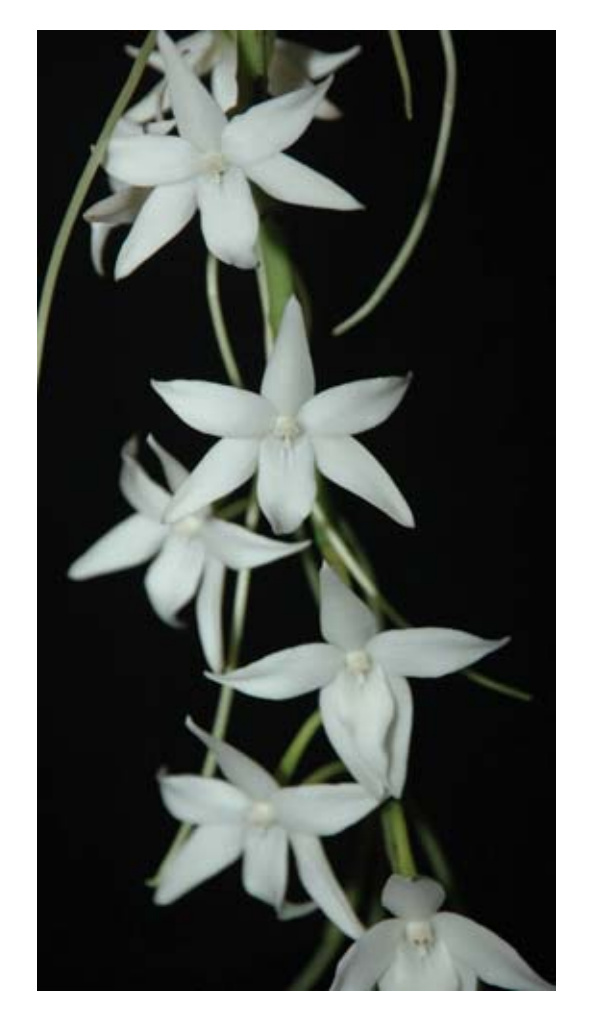
Aerangis citrata "Waterfield" HCC/AOS