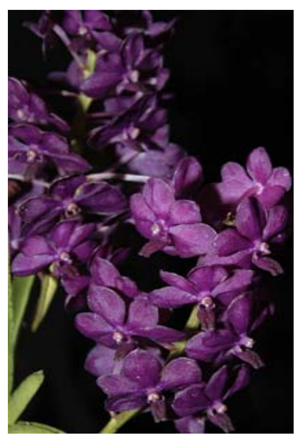
Vasco. Pine Rivers "Redland Sky" AM/AOS