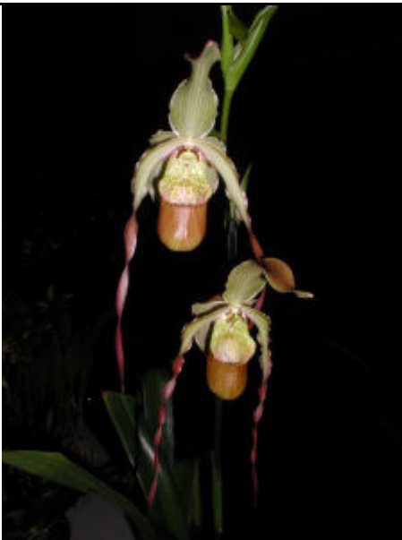
Phragmipedium Les Dirouilles