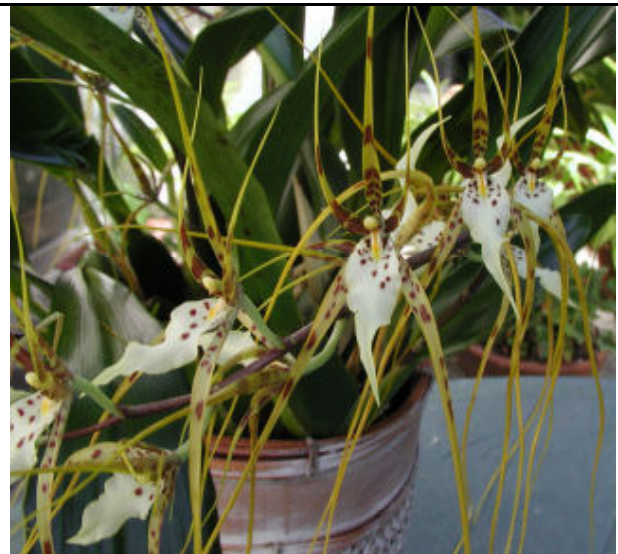
Brassia arcuigera 'Santa Barbara'