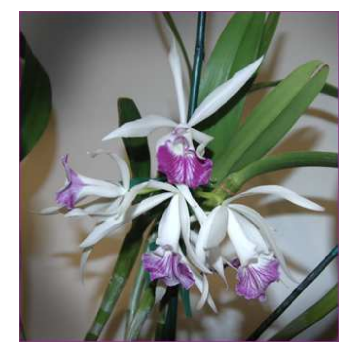
C. intermedia v. amethystina x Bl. Morning Glory