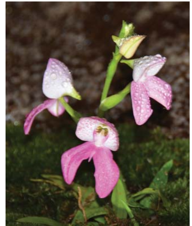
Disa Kewensis ( uniflora x tripetaloides ) WOC21 Johannesburg, S.A.

She will cover most of the sections of this large and diverse genus, including tips once the flowers have bloomed. Hopefully, we will learn enough that the spring flowering season will be sensational.