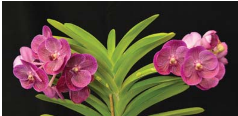
V. Crownfox 'Celestial Delight'