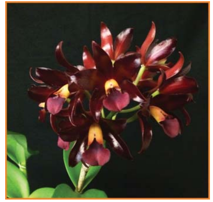
C. Chocolate Drop 'Volcano Queen'

The increasing costs of speakers, plant tables, and the expenses associated with our BBQ and Christmas party, require us to make a small increase in the club dues. The 2014 dues will be $30 for general members, $40 for mail delivery of the newsletter, and Commercial Members.