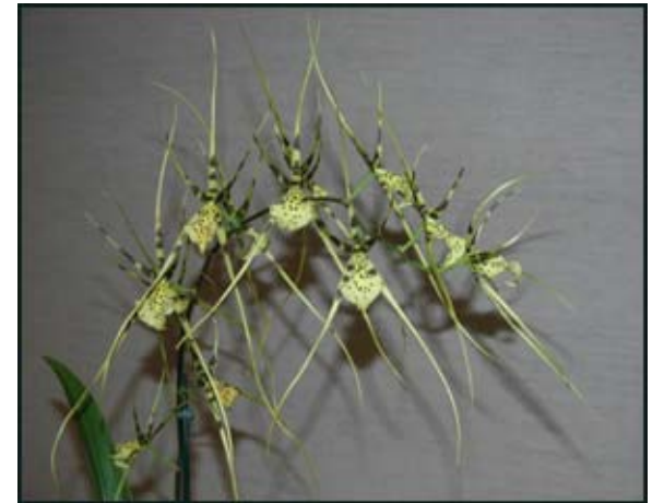
Brs. (Rex x Starry Knight 'Migration') x Spider's Gold 'Jordan'