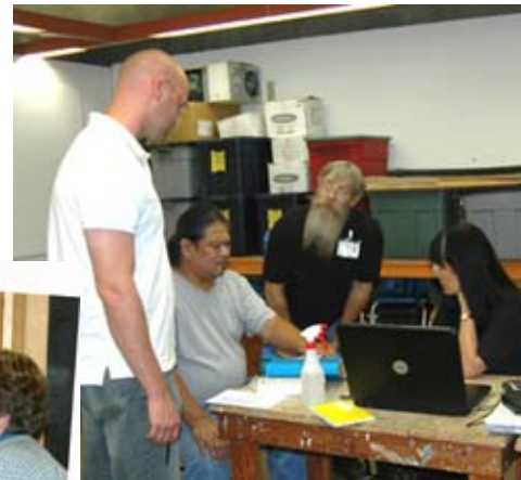
Aliceara Hilo Ablaze 'Hilo Gold'