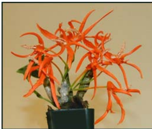
Den. lanyaiiae 'Thai Peppers'