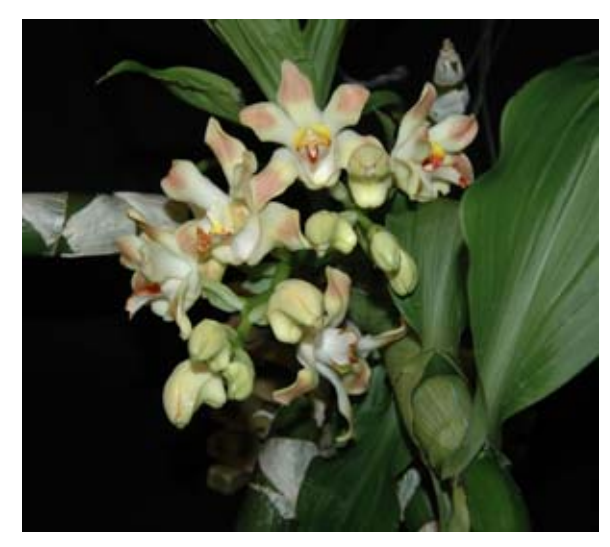
Chysis Langleyensis 'Golden Goliath'

These orchids do make fantastic hybrids when combined with Cycnoches. The cross imparts the best features of each species. The hybrid gets the size and