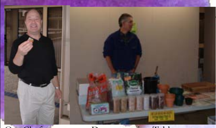
Our Chef Demonstration Table