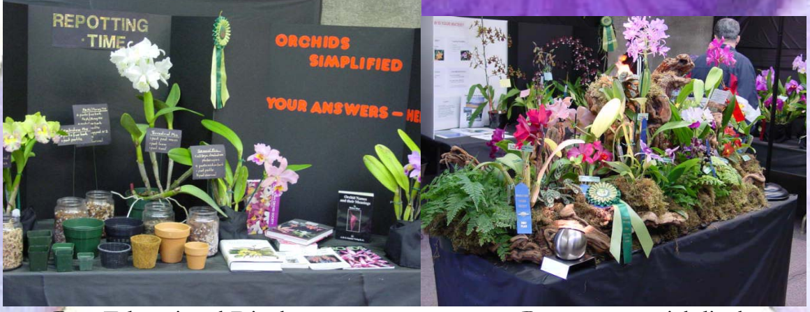
Best Educational Display