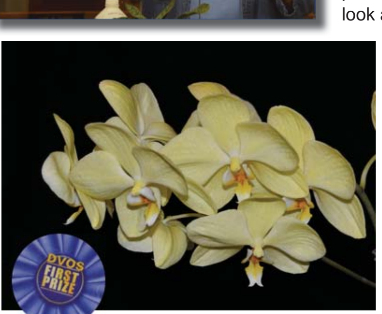
Phal. Golden Emperor

If you are a woman orchid grower and a shoe collector, then you will have no problem taking a major portion of your greenhouse or window sill and devoting it to the shoe of the plant kingdom- the lady slipper.