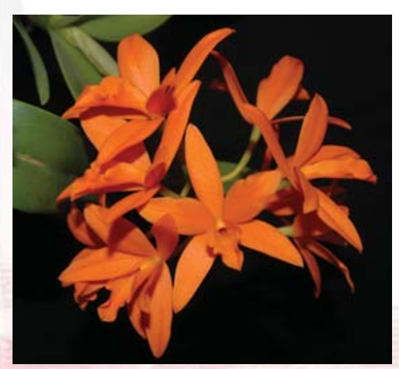
Lc. Trick or Treat

As many of the societies take a summer hiatus, here are some suggestions to help keep your orchid experience going through the summer. As an example, as you are repotting (either individually or as a society), perhaps you could solicit the assistance of new members of your society, give them some hands on experience and share divisions with them....a win-win for everyone. Visit commercial orchid firms listed on the AOS web site and in the Orchid Source Directory (I've heard of some members who keep theirs in their car so they can check while traveling on whose nearby). As you are planning your summer vacations or outing take advantage of reciprocal garden admissions AOS members enjoy. Use some hot lazy summer days exploring the members only section of the AOS web site......lots of hidden nuggets to enrich your orchid journey and improve growing or spark a new or renewed interest in a particular variety. Check out some of the summer orchid events (listed in Orchids as well as on the AOS website – keep checking for new additions) including Redland Orchid Festival, Shore Orchid Festival, Santa Barbara Orchid Estate International Fair, Central lowa Orchid Society Speakers Day, Houston Orchid Society Summer Workshop or Phalaenopsis Symposium.