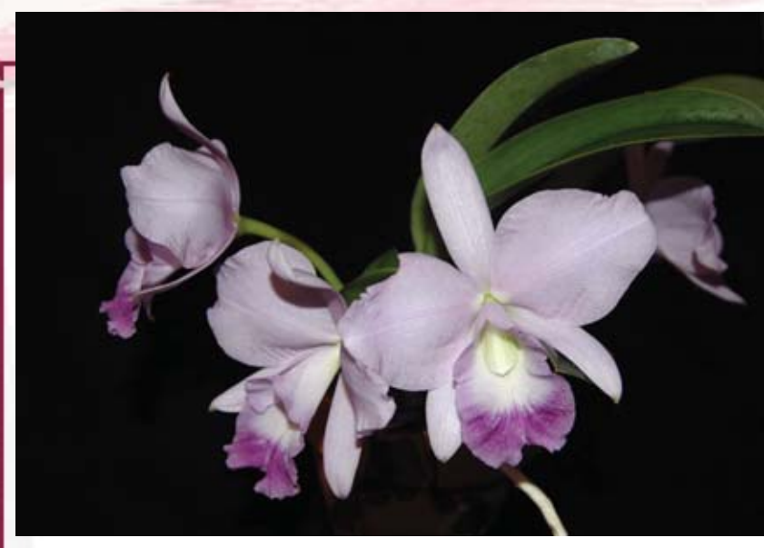
Lc. Lake Tahoe v. coerulea 'High Sky"