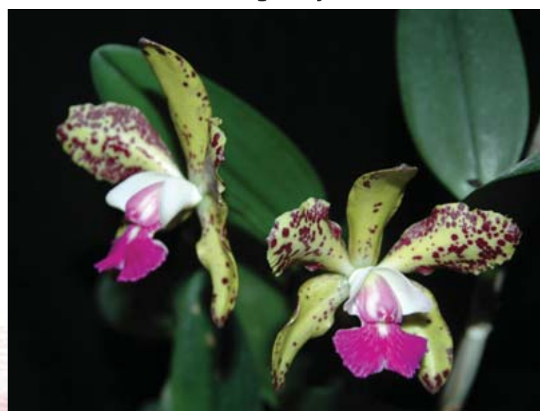
Blc. Sun Coast Sunspots