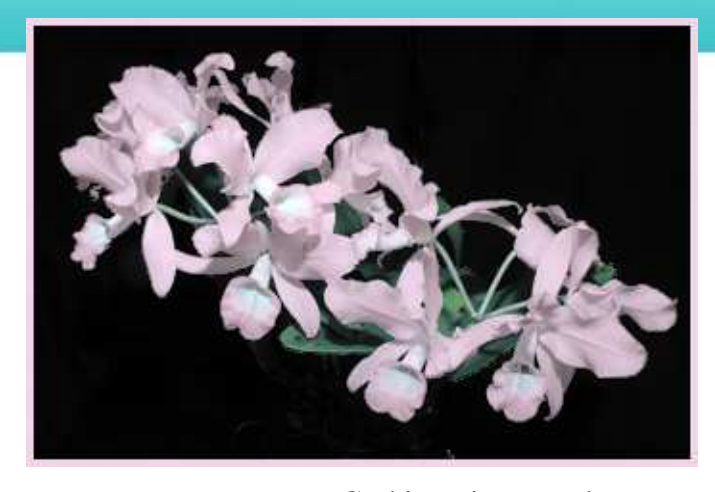
C. skinneri v. coerulea