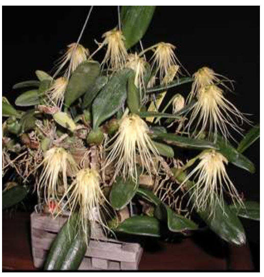
Bulbophyllum vaginatum