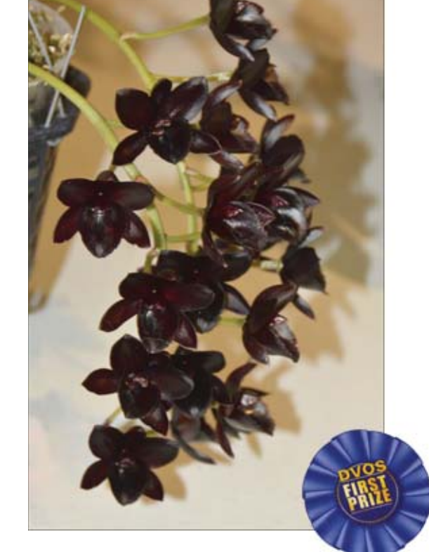
Fdk. After Dark 'Black Pearl'

They may win an award. The Sacramento Orchid Society show runs through the weekend, 3/29 & 3/30.