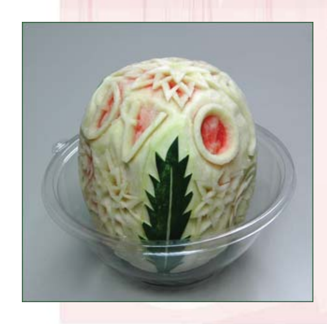
Watermelon carved by Shaylen Reisinger