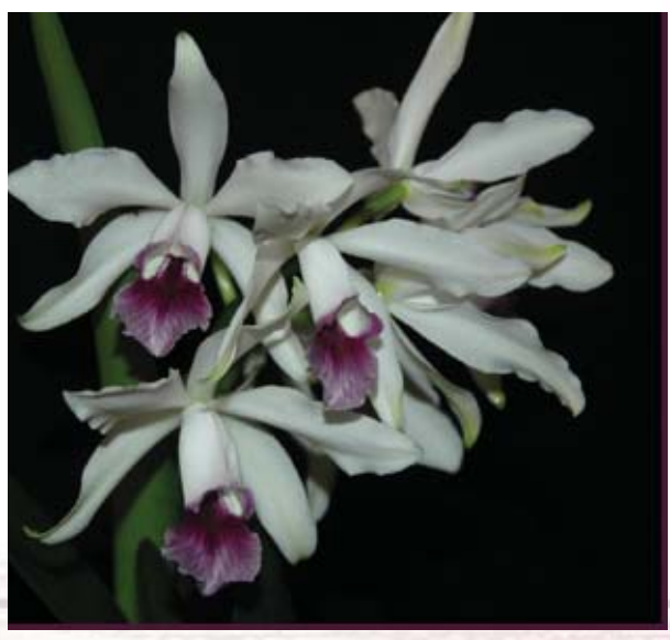
C. Schilleriana v. coerulea