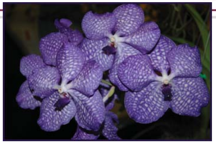
V. Sansai Blue 'Acker's Pride'