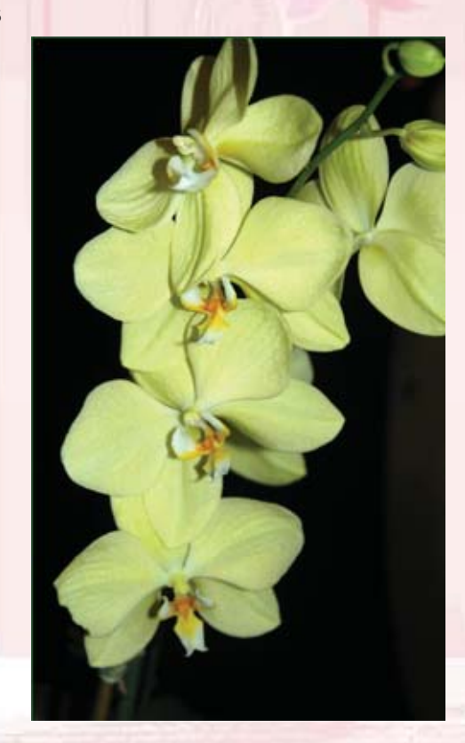
Phal. Golden Emperor

The traditional Affiliated Societies breakfast was well attended. We had a conversation of what the AOS means to the affiliated societies and what can the societies do to further promote the AOS. The AOS reps present at the meeting asked for more communication between the AOS and the affiliated societies. The Affiliated Societies Committee members will be reaching out to the societies throughout the upcoming months with the goal of getting all the contact information corrected and updated.