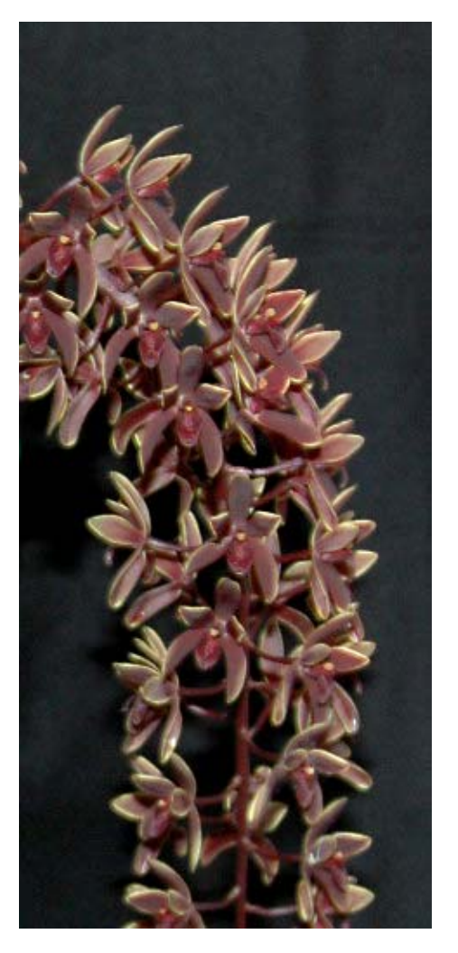
Cym. Little Beauty

Dennis and David promise lots of good deals, some as low a $7 on cattleya, oncidium and cymbidium seedlings and back bulbs.