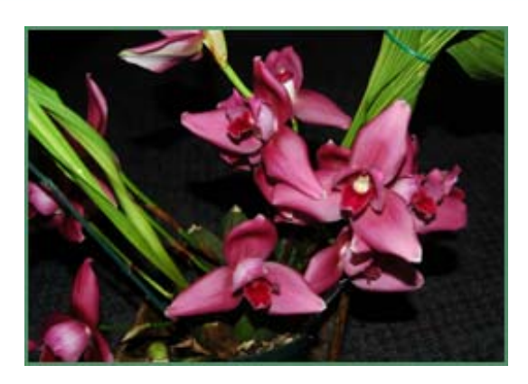
Lyc. Wyld Unicorn x (Malibu Canyon x Kovlina)