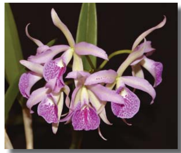
Bc. Maikai 'Mayumi' HCC/AOS