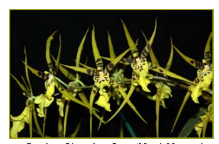
Brsdm. Shooting Star 'Maui Meteor'