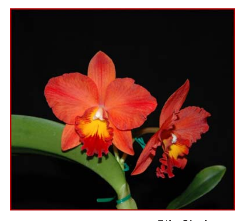
Rth. Gisela Hymmen 'Gary' AM/AOS