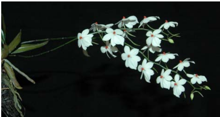
Aerangis luteoalba var. rhodosticta