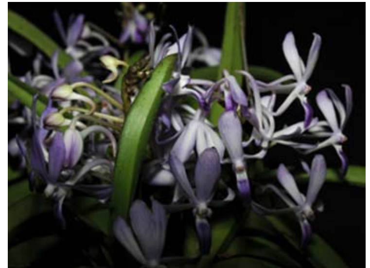
Neostylis Lou Sneary

You can bring your check made out to DVOS with the renewal form to the next meeting on December 11 th , 2008 or mail it to: