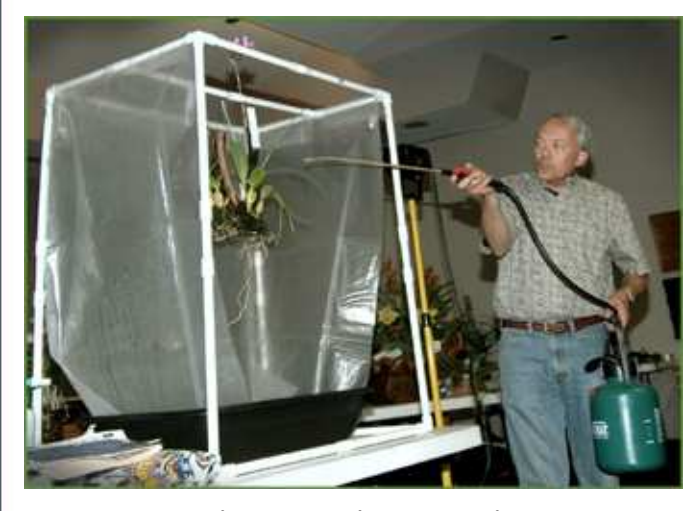
Duration - Duration - Duration

Growing Mounted Orchids – or Mimicking Mother Nature