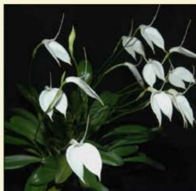
Masd. coccinea v. alba

Plant table will be provided by Fred Clarke, Sunset Valley Orchids.