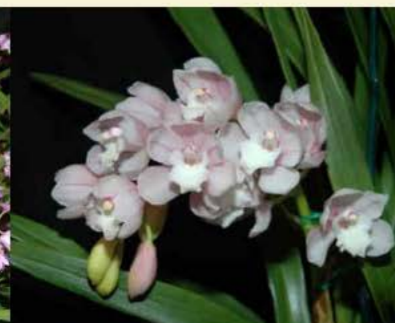
Cym. Mini Sarah 'Bridal Veil'