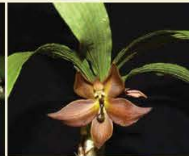
Cycnoches Jean E. Monnier