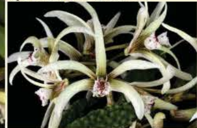
Den. cucumerinum 'Mr. Pickles'