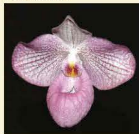
Paph. Magic Lantern