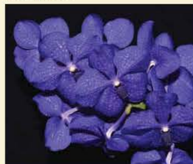
V. Pachara Delight