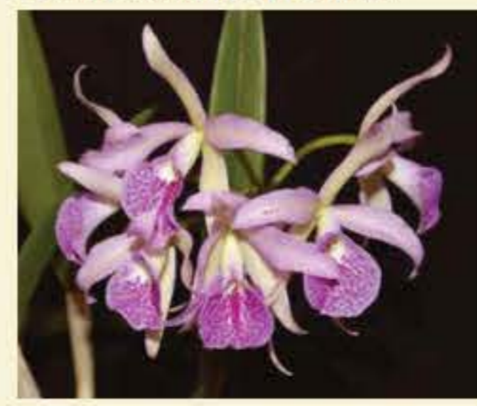
Bc. Maikai 'Mayumi' HCC/AOS