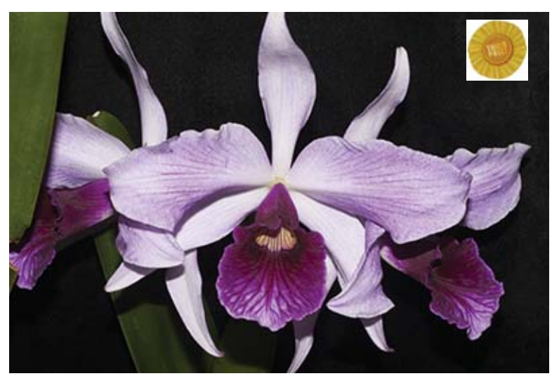
L. purpurata v. striata