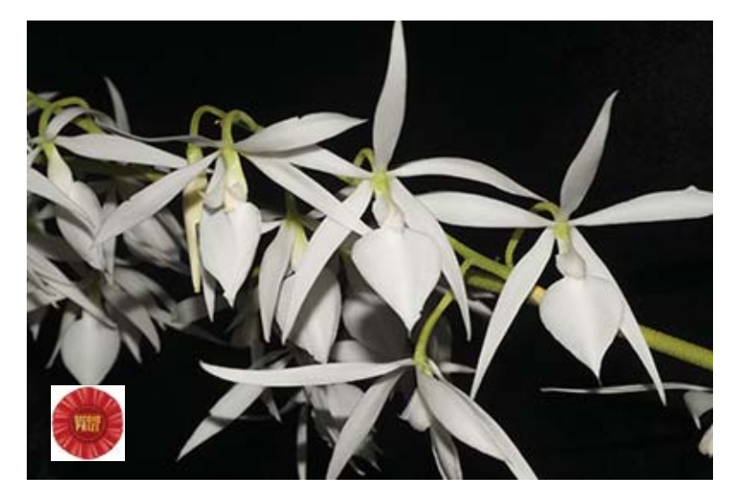
E. adenocaula v. alba 'Queen of Angels'