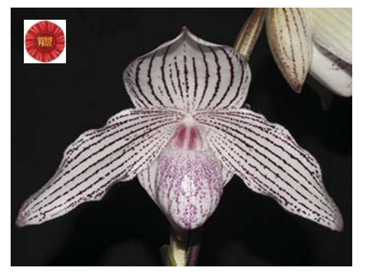
Paph. Woluwense 'Peppermint' AM/AOS

The Pacific Central Judging Region will NOT be holding July and August judgings in Oakland on the third Monday evening of July or August at the Garden Center on Lake Merritt.