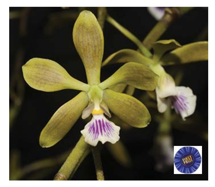
(Epi. steinbachiana x E. tampensis v. alba)