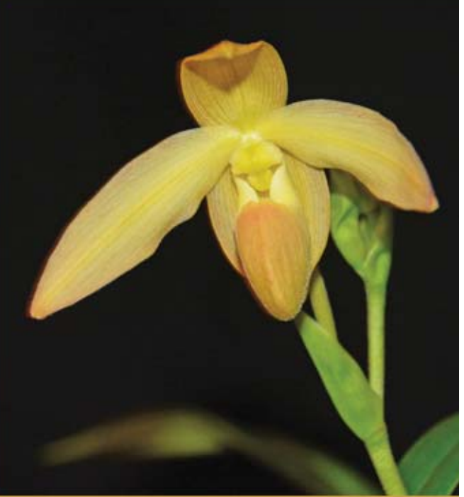
Phrag. Olaf Gruss