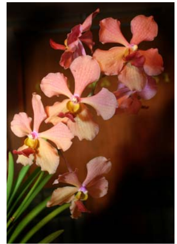
V. Joseph van Blevo x V. Hilo Queen

Orchid Digest - the current issue - July, Aug, Sept. has a very nice article on DVOS. (last page).