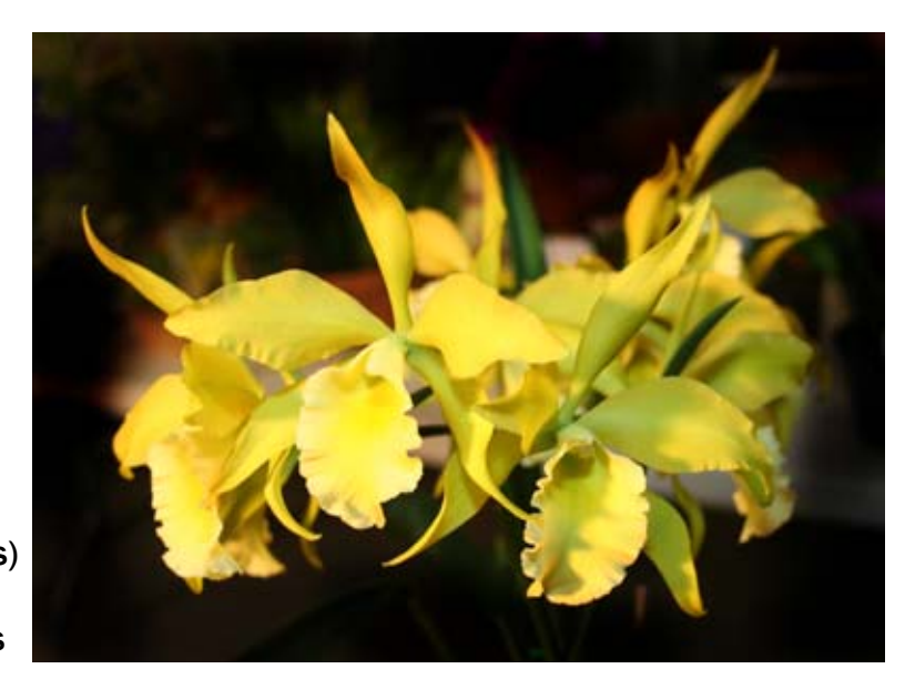
Blc. Everything Nice 'Showtime'