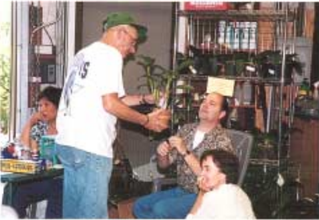
At the Tomassini greenhouse - Greenhouse Tour '02

ARTICLE DEADLINE FOR SEPT. NEWSLETTER IS FRIDAY, AUG. 30