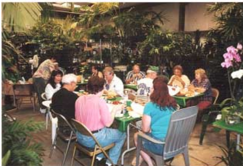
Lunch at the Tomassini's