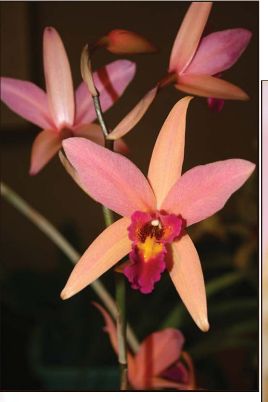
Lc. Santa Barbara Sunset 'Showtime' HCC/AOS

Cymbidium Liquidation (Bulk Buy x Overstock)